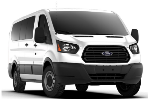
*Standard 8-Passenger Seating:

$24,489 base price, 10% off MSRP on Options!